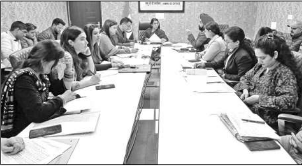
DC Jammu Avny Lavasa chairing a review meeting.

■ STATE TIMES NEWS JAMMU: Deputy Commissioner Jammu Avny Lavasa on Monday reviewed the progress of works of Rural Development Department (RDD) proposed under PRI, BDC and DDC components. The concerned official apprised the DC that there are total 3726 works of RDD under PRI BDC and DDC components including 3171 PRI works, 290 DDC works and 265 BDC works. Under PRI component, out of total 3171 works estimates