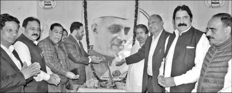
Senior Congress leaders paying tributes to Pt Jawahar Lal Nehru at Jammu.