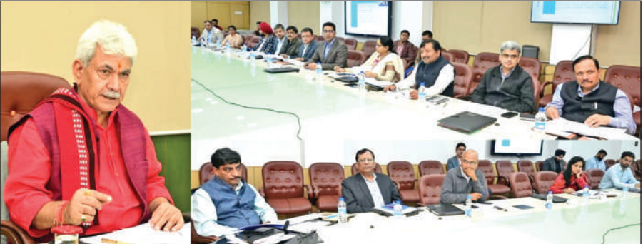
Lt Governor Manoj Sinha chairing 2nd Governing Body Meeting of Mission Youth at Jammu.

■ STATE TIMES NEWS JAMMU: Lieutenant Governor Manoj Sinha on Tuesday announced reservation of 10 percent seats under 'PARVAAZ' initiative for the children of armed forces personnel, who attained martyrdom in the line of duty in J&K and those from poor families. The 'PARVAAZ' initiative aims to fully assist young boys and girls to get free coaching for IAS, JKAS, NEET & JEE examinations. Mission Youth is focusing on educational development of youth through Super 75, SuperB 75, Navparivartan and University Collaboration like Initiatives. Chairing the 2nd Governing Body Meeting of Mission Youth, at the Civil Secretariat, the Lt Governor approved various Schemes and Plans focusing on the thrust areas including: Targeted implementation of existent Livelihood Generation Programmes; establishment of Residential Coaching Institutions for competitive examinations and professional courses; establishment and operationalization of District Youth Centers in all 20 Districts of J&K; education, career counseling and market-driven skill development