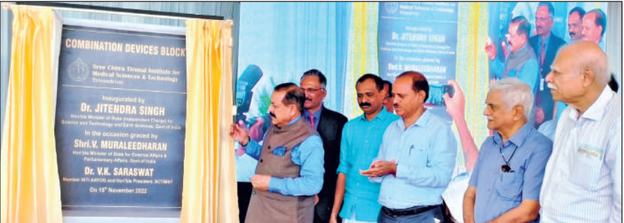
Union Minister Dr Jitendra Singh inaugurating one of the first of its kind Combined Devices Facility at Sree Chitra Tirunal Institute of Medical Sciences and Technology, Thiruvananthapuram, Kerala on Tuesday.

■ STATE TIMES NEWS THIRUVANANTHAPURAM: Union Minister, Dr Jitendra Singh on Tuesday said, India is among the top five countries in the world manufacturing life-saving high risk medical devices but the cost of our devices is about one-third of those manufactured by the other four countries. Addressing the faculty and students after inaugurating unique Combined Devices Facility at Sree Chitra Tirunal Institute of Medical Sciences and Technology here, Dr Jitendra said, technologies developed by the Institute like the artificial heart