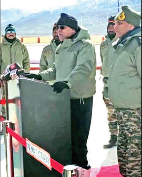
A dignitary speaking during the programme.

The Battle of Rezang La is etched in the annals of military history as one of the greatest last stands of all times comparable only to a few other battles the world over. The Battle stands out for sheer valour, grit and dogged determination of C Company of 13 KUMAON that fought to the last man in 1962 war against China, defending Rezang La in Eastern Ladakh, under the leadership of Maj Shaitan Singh.