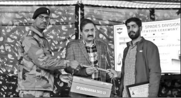
Tool-kits being given to participants.

The training was orgaised in collaboration with District