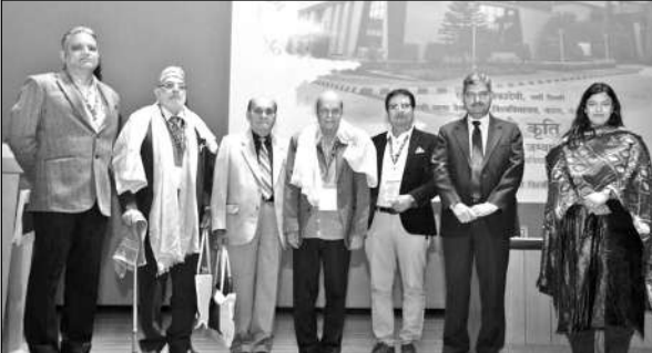
Dignitaries during the event at Katra.

The lecture was followed by a Panel discussion on contribution of Sahitya Akademi