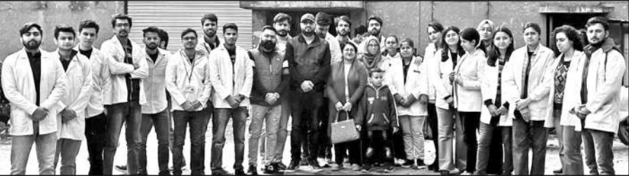
Students along with faculty during the educational tour.