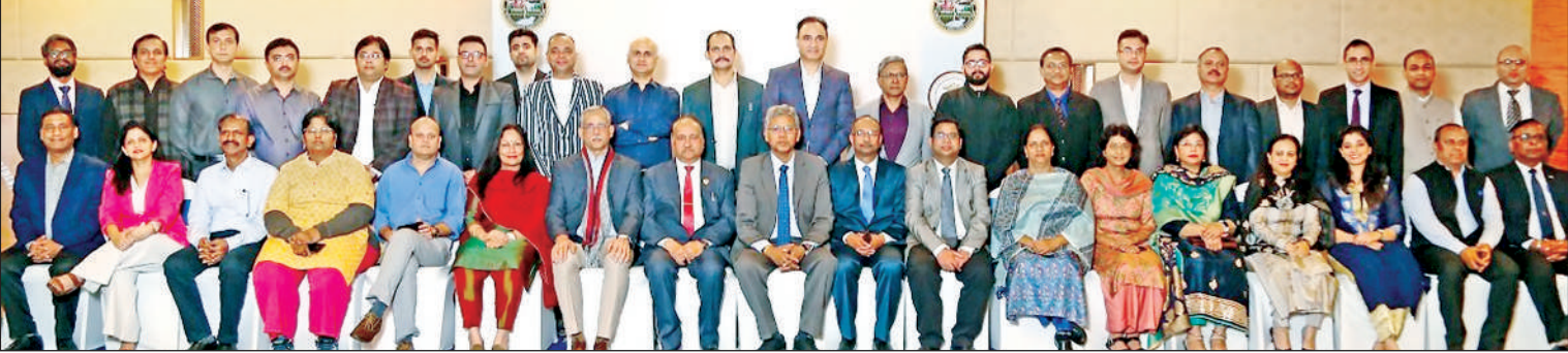
IIM Jammu, AIIMS Jammu and RFHHA representatives posing for a photograph during a programme at Jammu.