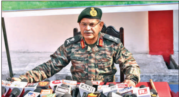
GOC-in-Chief, Northern Command, Lieutenant General Upendra Dwivedi briefing media at Poonch.