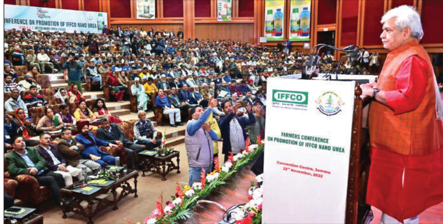
LG Manoj Sinha speaking at IFFCO's Farmer's Convention on Liquid Nano Urea in Jammu on Tuesday.

In order to meet the challenges of climate change,