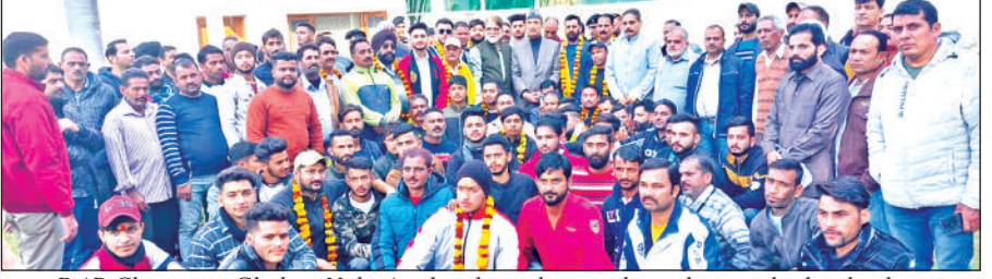
DAP Chairman, Ghulam Nabi Azad with newly joined members and other leaders.