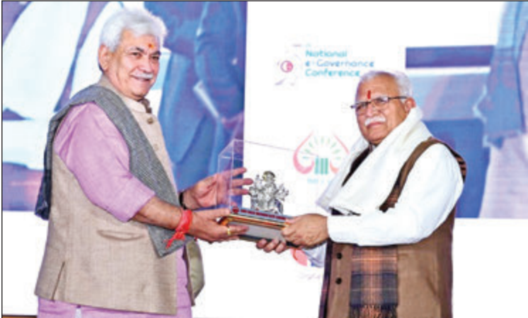
LG Manoj Sinha presenting idol of Mata Vaishno Devi to Chief Minister, Haryana Manohar Lal during the valedictory session of 25th National Conference on e-Governance at Katra on Sunday.

Under the guidance of Prime Minister Narendra Modi, he said J&K is an emerging model of digital government with focus on transparent governance and citizen-centric approach to delivering public services.