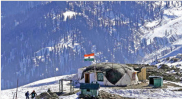
Tourists at Gulmarg ski resort.