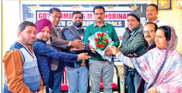
GMS staff members and players posing with CEO Poonch during felicitation function at Poonch.