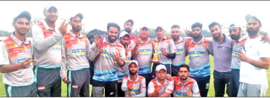
J&K team posing with officials after winning a match against Gujarat.