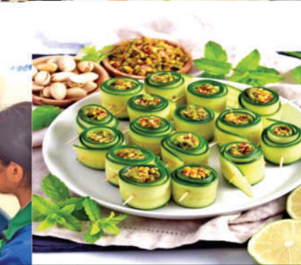
Students of JK Public School Kunjwani making different Salads during a weekly club activity.

spoon; Disposable katories & spoons for serving purpose; Gloves; Apron; Sanitizer & Mask