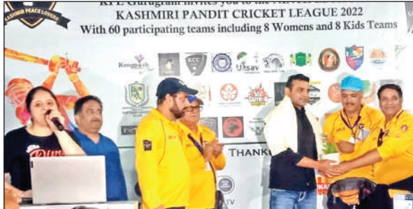
International cricketer Joginder Sharma during inaugural ceremony of KPCCL at Gurugram.