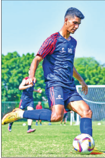
Staying with top Indian footballers