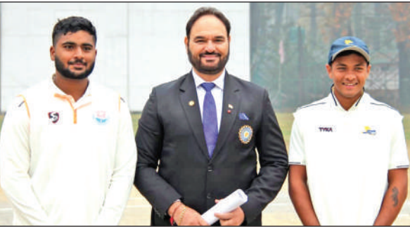
J&K team players posing with officials.