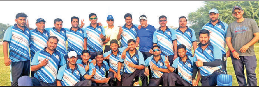
University of Jammu teams posing for photograph with officials after winning the match.