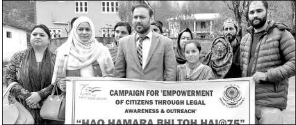
DLSA officials along with others during the programme.

The Mega Camp was organized by DLSA Bhadarwah in collaboration with the ADC, NGOs, Social Welfare Officer and sarpanchs of adjoining panchayats.