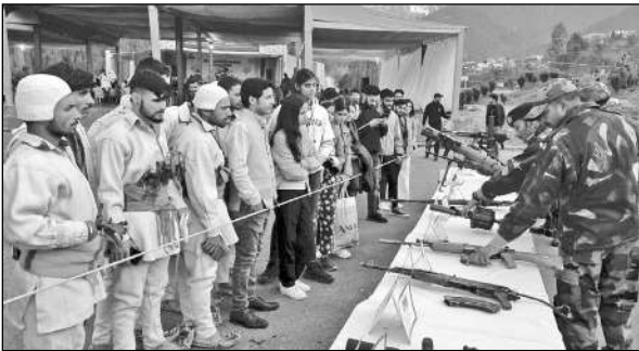
Students being acquainted with army weapons.

The Secretary also reiterated the objective of Legal Service Institutions which are making people aware about various Government Schemes. The programme was attended by staff members and PLVs of DLSA Bhadarwah.