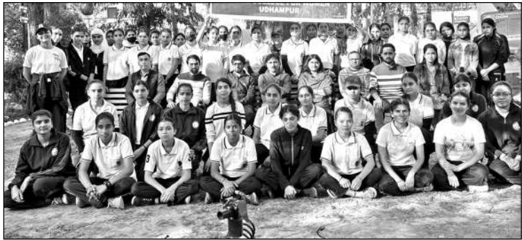
Organisers along with students and faculty during the programme.

The NSS Volunteers & NCC cadets of the College painted the logos of the College, NSS and NCC on the slanting space and College play ground. The logos were painted with a white base. The Volunteers also painted the letters- My College My Pride- on the