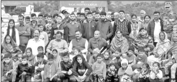
Army officials along with students during the programme.

NOWSHERA: Army is observing Vigilance Awareness Week with effect from 31 October 2022. As part of Vigilance Awareness, integrity pledge and awareness talk on vigilance week was organised at Panchayat Hall, Bareri on 06 November 2022.