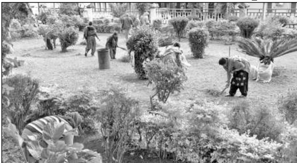
MUSS volunteers carrying out cleanliness drive.

■ STATE TIMES NEWS UDHAMPUR: As a part of cleanliness drive been launched by Manav Uttan Seva Samiti (MUSS) organized a cleanliness drive in the premises of Raj Hans Park in District Hospital Udhampur on Sunday. Later volunteers also removed the herbs and decaying bushes and weeds from Venus Chowk park.