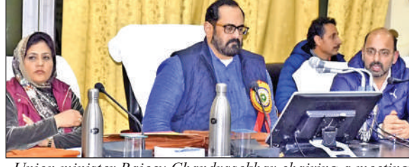
Union minister Rajeev Chandrasekhar chairing a meeting.