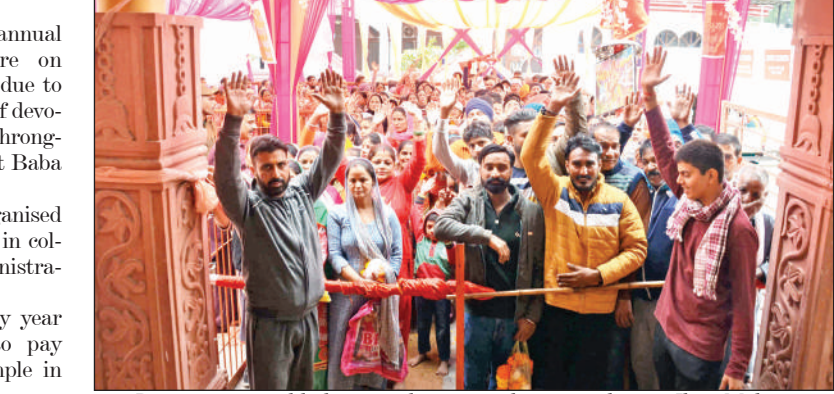
Devotees assembled in temple to pay obeisance during Jhiri Mela in Jammu on Monday.