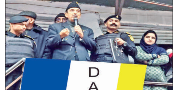
Chairman DAP and former CM Ghulam Nabi Azad addressing a gathering at Kishtwar.

Addressing mammoth public meetings at Kahara and Akhlyarpur of Bhalessa area, during his ongoing tour of the Doda district, despite heavy rains, Azad assured the people that on his return to power in the 'state', he will fulfill the mission of development initiated by him during