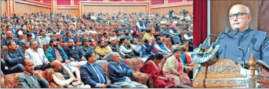
Jammu Mayor Rajinder Singh addressing a gathering during a programme 'Mayor For A Year' at Convention Centre Jammu on Friday.

Mayor further talked about the ongoing anti-corruption campaign under the banner of