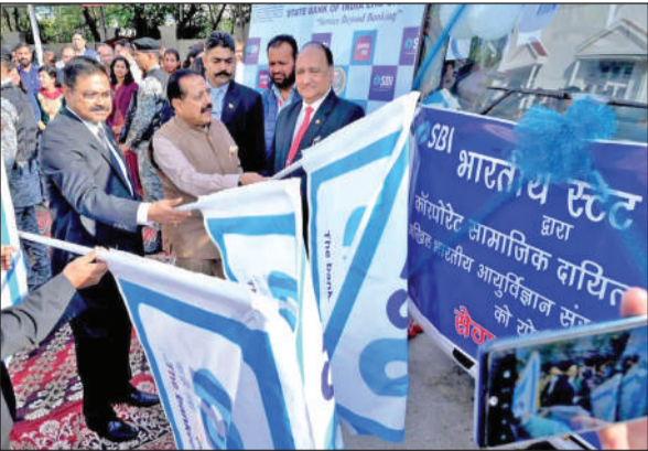
Union Minister Dr Jitendra Singh flagging off 32-seater bus donated to AIIMS, Jammu by the SBI.

The Minister was speaking after flagging off a 32-seater