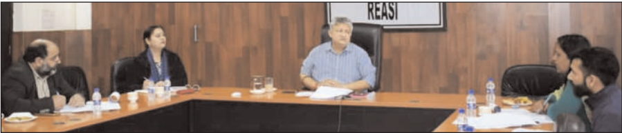
DC Reasi, Vishesh Mahajan chairing a meeting.

■ STATE TIMES NEWS REASI: To review the progress and implementation of Labour Department schemes, the Deputy Commissioner Reasi, Vishesh Mahajan on Monday chaired a meeting of stakeholder departments here in the video conference hall of the DC office complex Reasi. The Deputy Commissioner held a threadbare deliberation on implementation of eighteen online services and took a comprehensive review of the schemes. Marking a significant achievement, the Deputy