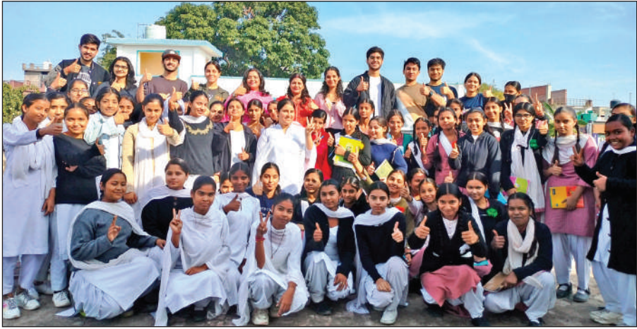
Students posing for a photograph Flowmappr team and faculty members.

innovative features took center stage, illustrating its role in revolutionizing menstrual tracking and fostering a community where women can freely discuss health-related topics.