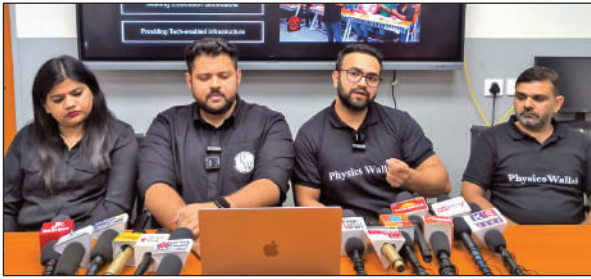
Physics Wallah officials addressing a press conference.

Students have the opportunity to secure up to 100% scholarships through PWNSAT 2023 phase II (Physics Wallah National Scholarship cum Admission Test), through which PW is offering scholarships worth Rs 200 crores to meritorious students. The exam will be conducted in both offline and online modes and will be open to students from class 8 to 12, as well as drop-pers aspiring to study for JEE or NEET. The PWNSAT exam will be held on November 26th, December 3rd & 10th December, 2023, in offline