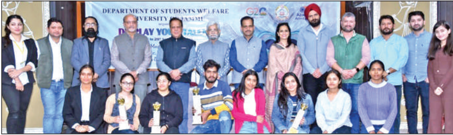
Participants posing for a photograph with dignitaries.