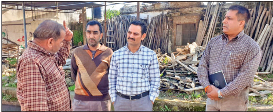
Managing Director interacting with entrepreneurs during visits of Industrial Units assisted financially by Corporation.