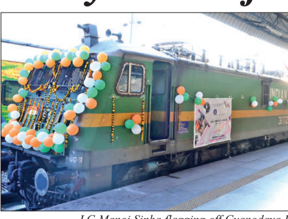
Lt Governor Manoj Sinha flagging off Gyanodaya Express, College on Wheels from Katra on Sunday.

KATRA: Lieutenant Governor Manoj Sinha on Sunday flagged off "Gyanodaya Express-College on Wheels", the first-of-its-kind mobile educational endeavor in Jammu Kashmir, from Shri Mata Vaishno Devi Railway Station, Katra. In his address, the Lt Governor commended the unique and unprecedented effort of the Higher Education Council, University of Jammu and everyone associated with the initiative aims at empowering approximately 700 girl students from across Universities of the Union Territory. "Gyanodaya Express will travel through various states