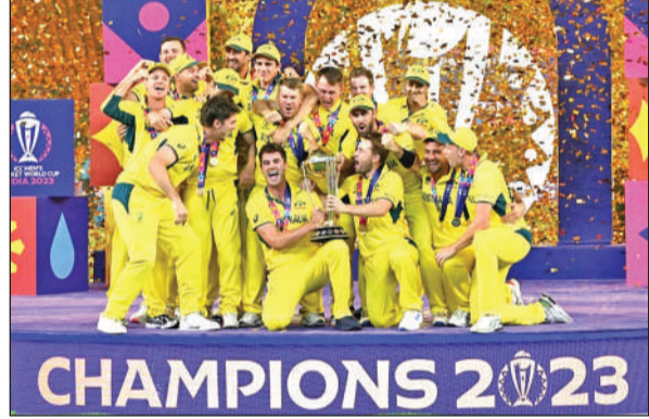
Australia cricket team celebrating their sixth ODI World Cup win in Ahmedabad.

AHMEDABAD: India's dreams of winning a third World Cup title lay in tatters after an inexplicable meltdown saw them crash to a six-wicket defeat against an indefatigable Australia here on Sunday, plunging the cricket-obsessed country into deep mourning. Australia thus won a record-extending sixth World Cup title, stretching their dominance in the tournament that started way back in 1975. Put in to bat, India ended up with a below-par 240 despite contributions from Rohit Sharma (47 off 31 balls), Virat Kohli (54 off 63)