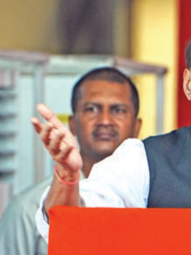
Defence Minister Rajnath Singh speaking at a podium during an election rally.

Addressing an election rally in Rajasthan's Shahpura ahead of the November 25 Assembly polls, he said India is no longer weak and the world listens carefully to what it says. Singh claimed that at the time of the Russia-Ukraine war, Modi called the presidents of Russia, Ukraine and the US to get the war halted for four to five hours and the Indian students stuck there were evacuated. "This has happened because India's stature has increased," he said.