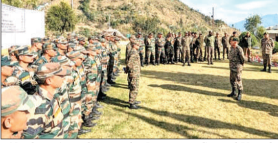
Northern Army Commander Lieutenant General Upendra Dwivedi during visit to Rajouri.

JAMMU: Northern Army Commander Lieutenant General Upendra Dwivedi visited troops deployed in the counter-terrorism grid in Rajouri and Kulgam districts of Jammu and Kashmir and complimented the troops for neutralising six terrorists in two separate successful operations. While five Lashkar-e-Taiba (LeT) terrorists were killed in Nehama village during an 18-hour long operation on Friday, another terrorist was eliminated in an encounter in Budhal area of Rajouri district the same day.