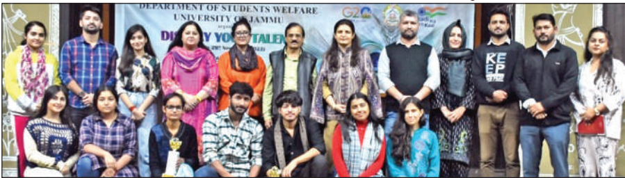
Participating students posing for a photograph with dignitaries.