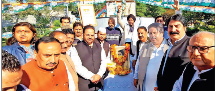
Senior Congress leaders paying tributes to Indira Gandhi.

and faced numerous challenges successfully.