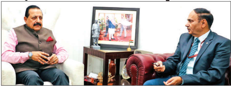
Chief Information Commissioner (CIC) of India, Heeralal Samariya calling on Union Minister Dr Jitendra Singh at New Delhi on Sunday.

During an hour-long meeting with the Minister, Samariya informed the Minister that the disposal rate of Right to Information (RTI) Appeals/Complaints has, for the first time, crossed 90% in the current Financial Year of 2023-24. Dr Jitendra lauded the Central Information Commission for achieving consistent decline in pendency with corresponding rise in disposal of the RTI appeals.