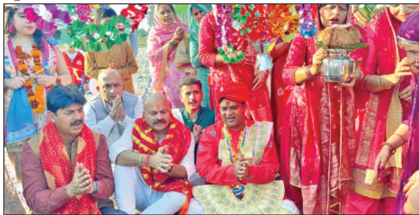
J&K BJP Vice President at closing ceremony of Shrimad Bhagwad Katha.

The senior BJP leader elaborated on the transformative power of spirituality in freeing individuals from the constraints of self-interest, greed, and hatred. He underlined that spirituality paves the way towards love and righteousness, which he described as the core of all religious beliefs.