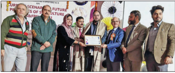
Dignitaries being honoured during the programme.