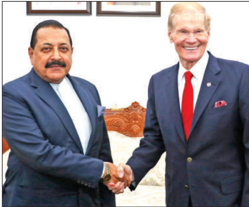
A high-level delegation of premier USA Space agency NASA led by its Chief Administrator Bill Nelson calling on Union Minister Dr. Jitendra Singh at North Block, New Delhi on Tuesday.

■ STATE TIMES NEWS NEW DELHI: India and the US will launch the joint microwave remote sensing satellite for Earth observation, named NASA-ISRO Synthetic Aperture Radar (NISAR) in the first quarter of next year, said Union Minister Dr Jitendra Singh during a meeting with a high-level delegation of premier USA agency NASA led by its Chief Administrator Bill Nelson who called on him here today. NISAR is targeted for launch onboard India's GSLV. Data from NISAR will be highly suitable for studying the land ecosystems, deformation of solid earth, mountain & polar cryosphere, sea ice and coastal oceans in regional to global scale. It was informed that ISRO's S-band SAR was integrated with NASA's L-band SAR at JPL/NASA and integrated L & S band SAR is currently undergoing testing with the satellite at URSC, Bangalore with participation of NASA/JPL officials. Congratulating Dr Jitendra Singh for the historic Chandrayaan-3 landing on the virgin South Polar region of the Moon, Nelson urged Dr Jitendra Singh for expediting the programme related to India's first astronaut aboard a NASA rocket to the International Space Station (ISS). During the visit of Prime Minister Narendra Modi to the US earlier this year, the two sides agreed to launch a two-week joint India-US Space flight next year. NASA is identifying an