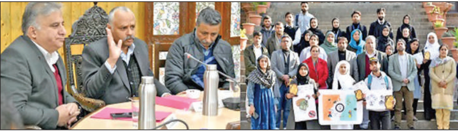
ASC faculty members and participating students at Srinagar on Sunday.