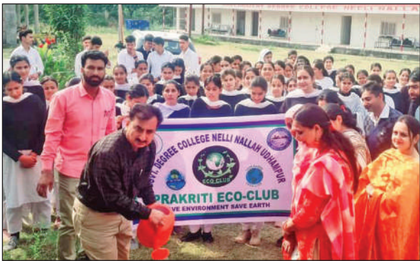
Students and faculty members during the event.

■ STATE TIMES NEWS UDHAMPUR: Eco Club of Government Degree College Neeli Nallah - Udhampur, in collaboration with NGO 'live for others-Being helpful foundation (LFO-BHF)' organised a plantation cum awareness program to mark the UT Foundation day under the guidance of the college Principal, Prof.Hans Raj. The program was in sequel to string of activities conducted by different clubs of the college. The main objective of this program was to sensitise the students about the value and importance of trees which are an important National asset. Different tree species