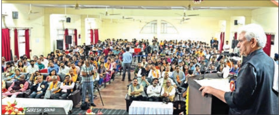
LG Manoj Sinha addressing Vedic Conference in Jammu on Saturday.

Addressing the first Vedic Conference in Jammu on the theme "Vedon Mein Vigyan", at Shri Ranbir Campus, Central Sanskrit University, Kot Bhalwal, the Lieutenant Governor said: "India has been a powerhouse of science and spirituality for thousands of years. When the Vedas were composed, India was the centre of world's economy, education, culture and philosophy. It was the engine of world civilization and our country laid the foundation of socio-economic progress through science, mathematics, astronomy and