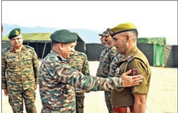
Army Chief General Upendra Dwivedi interacting with troops at Kathua on Saturday.

COAS, visited forward units of Rising Star Corps deployed in Kathua, Jammu