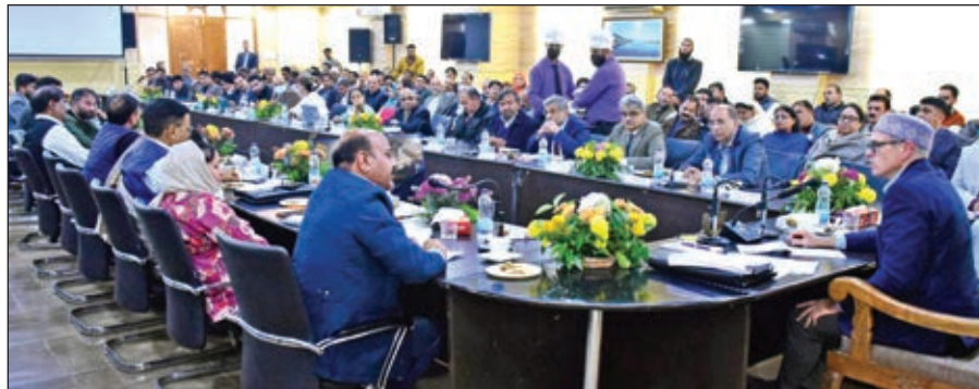
CM Omar Abdullah chairing meeting of officers at Ganderbal on Saturday.