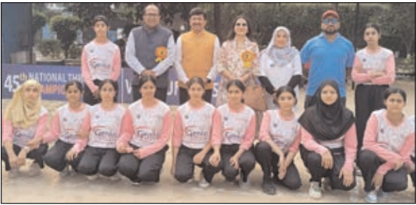
Team along with coaches before departure.