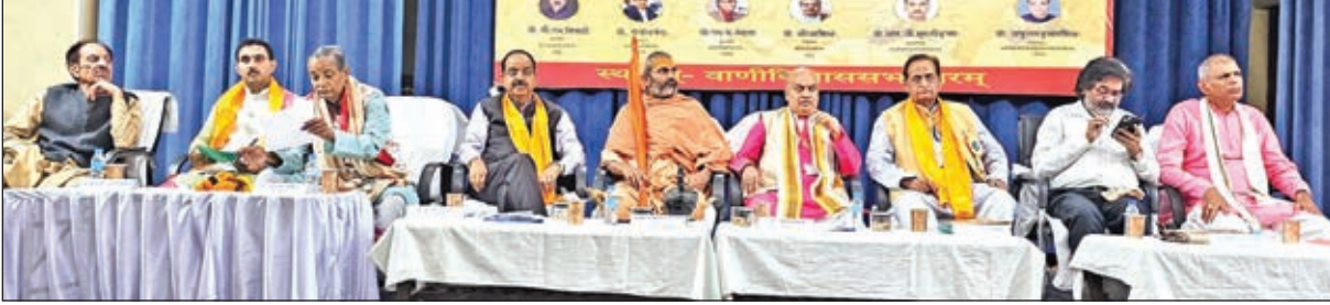
Dignitaries at International Vedic Conference on "Vedon Mein Vigyan" at Central Sanskrit University, Shri Ranbir Campus.