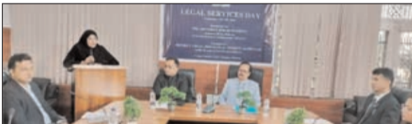
Officials during the programme at Kishtwar.