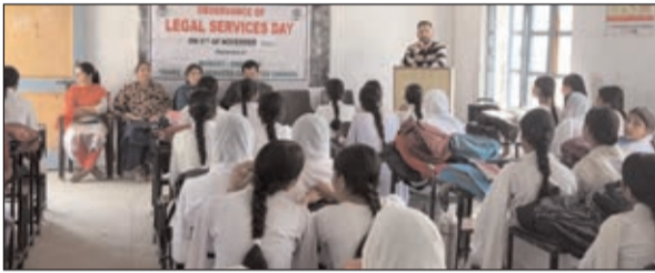
A resource person delivering lecture.