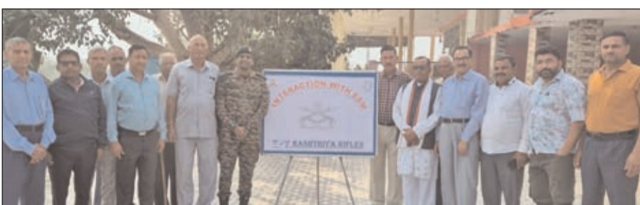
Army officials along with ex-servicemen during the programme.