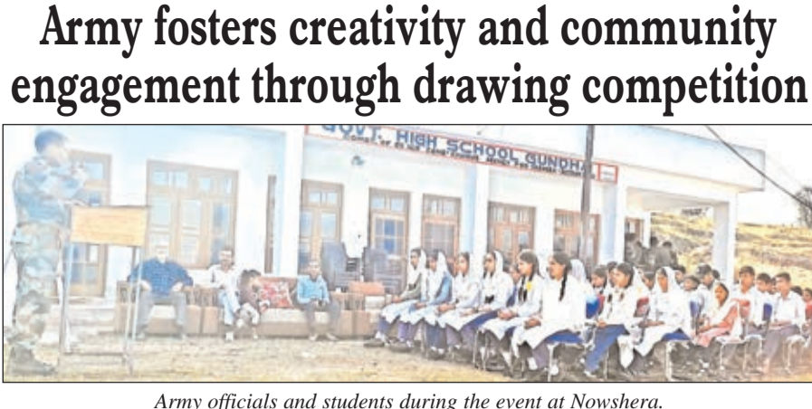
Army officials and students during the event at Nowshera.