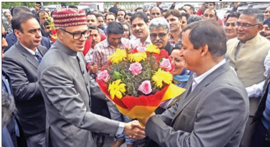
CM Omar Abdullah receiving grand reception on his arrival at Civil Secretariat Jammu on Monday.

STATE TIMES NEWS JAMMU: Chief Minister Omar Abdullah received a rousing welcome at the Civil Secretariat in Jammu upon his arrival to assume office in the winter capital on Monday.