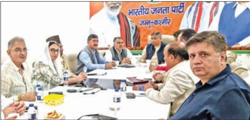
BJP National General Secretary Tarun Chugh chairing meeting of party workers.

Asking the party leaders to make a special effort to touch all parts of J&K and establish contact with people of all