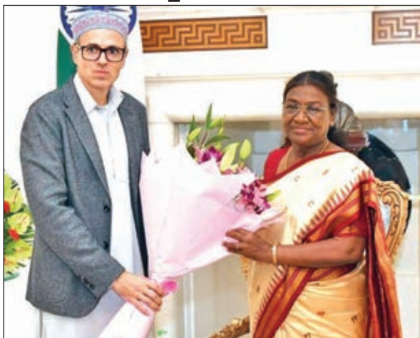
Chief Minister Omar Abdullah meeting President Droupadi Murmu at Rashtrapati Bhavan on Thursday.

In recent weeks, he has held discussions with top leaders, including Prime Minister Narendra Modi, Union Home