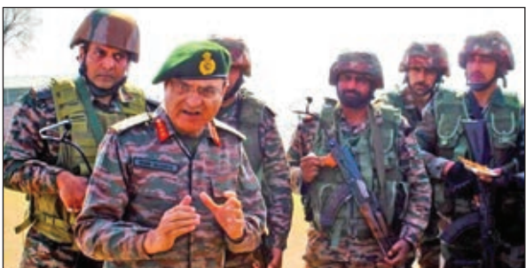
GOC 16 Corps, Lieutenant General Navin Sachdeva interacting with troops at Poonch.