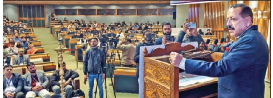
Union Minister Dr. Jitendra Singh speaking after inaugurating "One Week One Theme-CSIR Healthcare Theme Conclave" at SKICC, Srinagar on Saturday.

STATE TIMES NEWS SRINAGAR: At the CSIR Healthcare Theme Conclave's inaugural session at SKICC on Saturday, Dr. Jitendra Singh, Union Minister of State (Independent Charge) for Science and Technology; Earth Sciences and Minister of State for PMO, Department of Atomic Energy, Department of Space, Personnel, Public Grievances and Pensions, described Jammu & Kashmir as a key player in India's 'Viksit Bharat' journey.