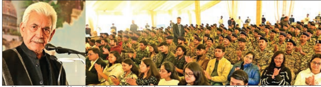
Lieutenant Governor Manoj Sinha addressing a cultural evening to commemorate the Jharkhand Day at Raj Bhawan.

STATE TIMES NEWS JAMMU: Jammu Kashmir Raj Bhawan on Saturday hosted a cultural evening to commemorate the Jharkhand Day, which was celebrated on November 15. Students, Security personnel and residents of Jharkhand