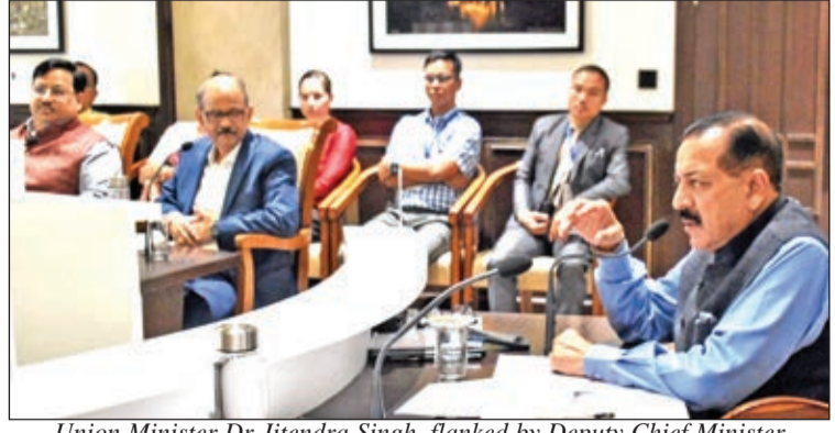
Union Minister Dr. Jitendra Singh, flanked by Deputy Chief Minister Chowna Mein, convening a high level meeting of administration at Namsal, Arunachal Pradesh on Sunday.

STATE TIMES NEWS NAMSAL: Union Minister, Dr. Jitendra Singh began his visit to Namsal district in Arunachal Pradesh on Sunday, marking a significant push for development under the Aspirational Districts Programme (ADP). Soon after his arrival, the Union Minister, accompanied by the Deputy Chief Minister of Arunachal Pradesh, Chowna Mein, convened a high level meeting of the administration to review "Performance Indicators" of the peripheral Northeast Aspirational District of Namsal. The three-day visit aims to assess progress, address challenges, and bolster efforts to transform the region into a model of inclusive growth. Earlier, upon his arrival, Dr Jitendra Singh was warmly received by Deputy Chief Minister of Arunachal Pradesh Sri Chowna Mein, senior officials, and members of the district administration. Following the ceremonial welcome, the dignitaries joined Dr. Jitendra Singh in a review meeting to discuss the district's development initiatives