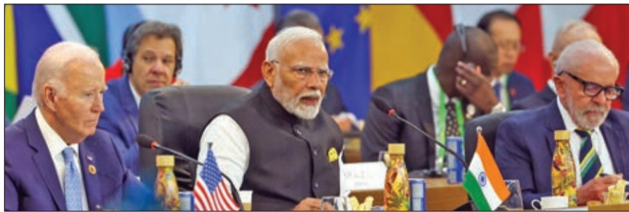
PM Narendra Modi speaking at G20 Session on "Social Inclusion and the Fight Against Hunger and Poverty" at Rio de Janeiro, in Brazil on Monday.