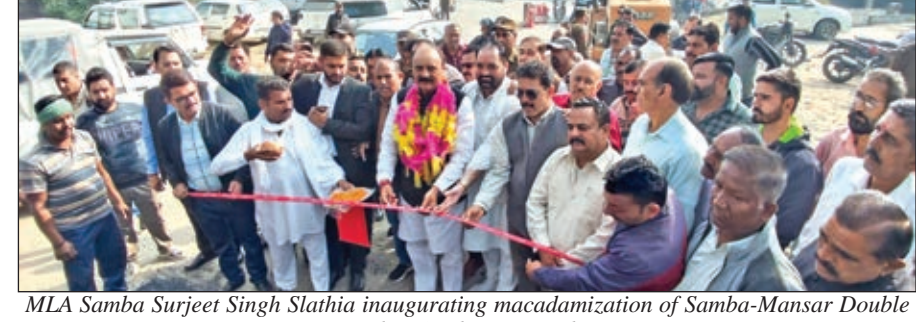
Road at Samba on Monday.

prosperity of the people Interacting with people, after kick-starting macadamization of Samba Mansar Double Road at an estimated cost of Rs 80 lakhs, Slathia said that a strong infrastructural edifice has been laid during the past five years that is needed to be sustained and carried forward in a missionary mode. "Our collective efforts are