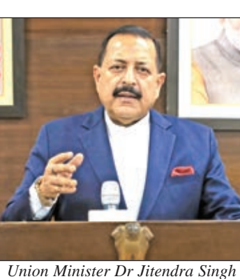
addressing the inaugural session of "National Workshop on Redressal of Public Grievances" at Vigyan Bhavan, New Delhi on Monday.

undergone significant reforms, including a ten-step revamp that has revolutionized grievance management. These reforms have led to over