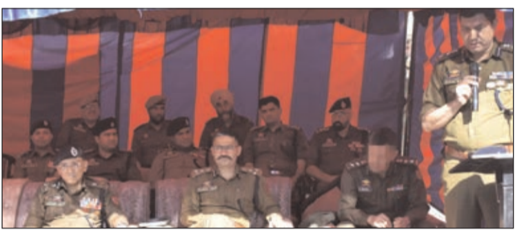
ADGP Jammu Zone Anand Jain during visit to border area in Jammu.

to secure convictions, expedite case disposals and reduce case backlogs, the spokesperson said. The ADGP has been visiting grassroots levels in various districts, including border areas, to review the security situation, operational preparedness, deployment and training of police forces.