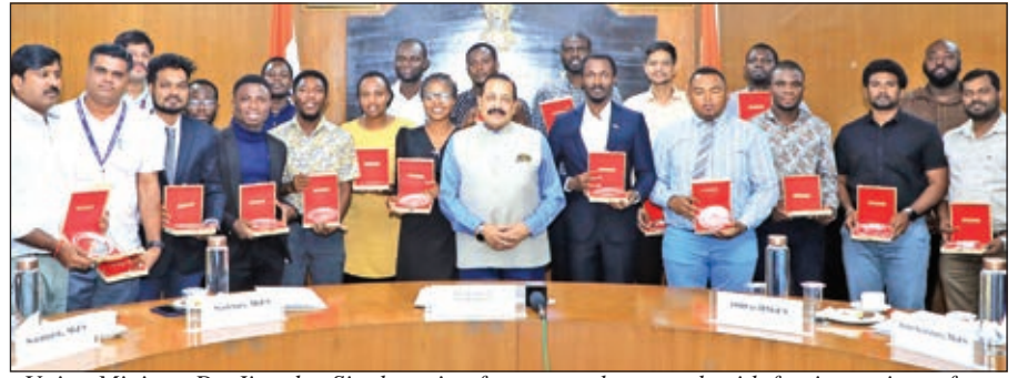
Union Minister Dr. Jitendra Singh posing for group photograph with foreign trainees from six countries after formally felicitating them at Ministry of Earth Sciences, New Delhi.

Dr Jitendra felicitates foreign Trainees in 'Ocean Exploration', underlines India's 'Blue Economy' initiatives