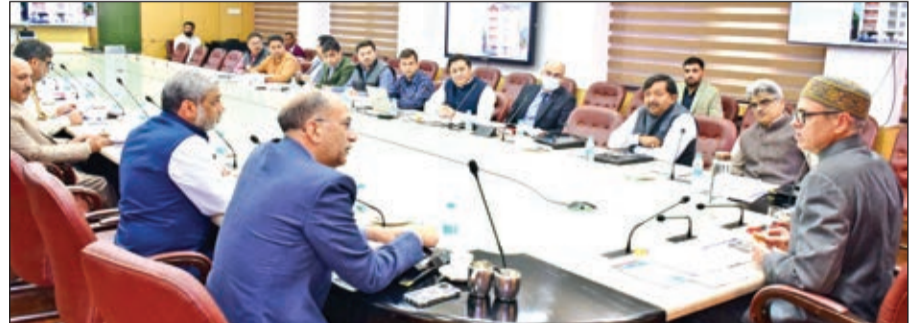
CM Omar Abdullah chairing meeting to review functioning of Estates Department in Jammu on Tuesday.

STATE TIMES NEWS JAMMU: Directing the Estates Department to prepare assets and occupancy lists for properties in both Jammu and Kashmir divisions, to ensure that there is proper mechanism for allotments as per entitlement, Chief Minister Omar Abdullah on Tuesday called for the establishment of consolidated allotment rules to ensure transparency and accountability in allotting accommodations. Chairing review meeting of the Estates Department, the Chief Minister also called for making a comprehensive assessment of facilities required for the next 15 years, emphasizing the need to transition from a rental-based system to a sustainable infrastructure model. Calling rentals "a constant drain," he proposed shifting focus towards construction projects and suggested short-term hiring as an interim