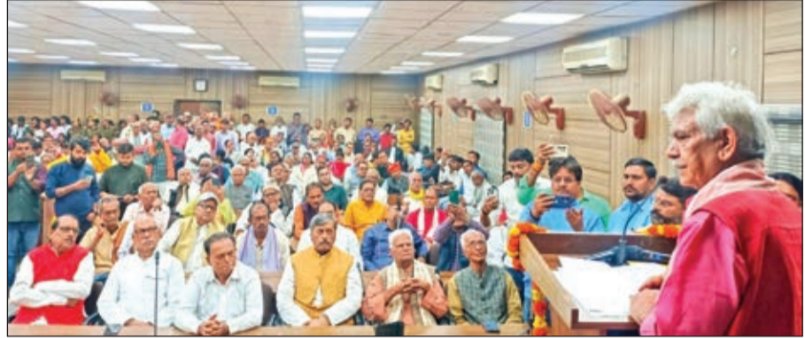
LG Manoj Sinha addressing at Jamm Shatabdi Samaroh of famous literary figure of Hindi and Bhojpuri literature, Dr. Viveki Rai, in Ghazipur on Tuesday.

STATE TIMES NEWS GHAZIPUR, UTTR PRADESH: Lieutenant Governor Manoj Sinha on Tuesday attended the Jamm Shatabdi Samaroh of famous literary figure of Hindi and Bhojpuri literature, Dr. Viveki Rai, in Ghazipur. Paying homage to Dr. Viveki Rai, the Lieutenant Governor said his wisdom and ideals continue to inspire millions across the country and guiding us along in realising our dream of a developed nation. Dr. Viveki Rai, through his writings, brought out the aspirations of rural India, and the struggle of common man and deprived sections of the society, he said. On the occasion, the Lieutenant Governor called upon the people to take 5 pledges to achieve 5 future goals to pay a fitting tribute to Dr. Viveki Rai. "Our first resolution should be to preserve and strength-