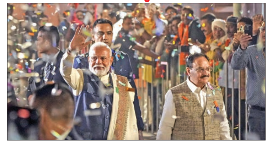
PM Narendra Modi with Union Minister and BJP National President JP Nadda during celebration of party's victory in Maharashtra Assembly elections and in several bypolls at BJP headquarters in New Delhi on Saturday.