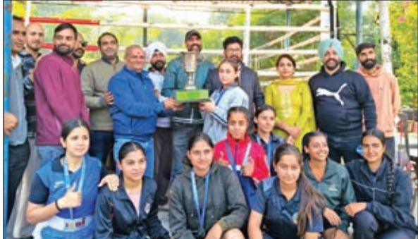
GCW Udhampur team receiving trophy from chief guest.