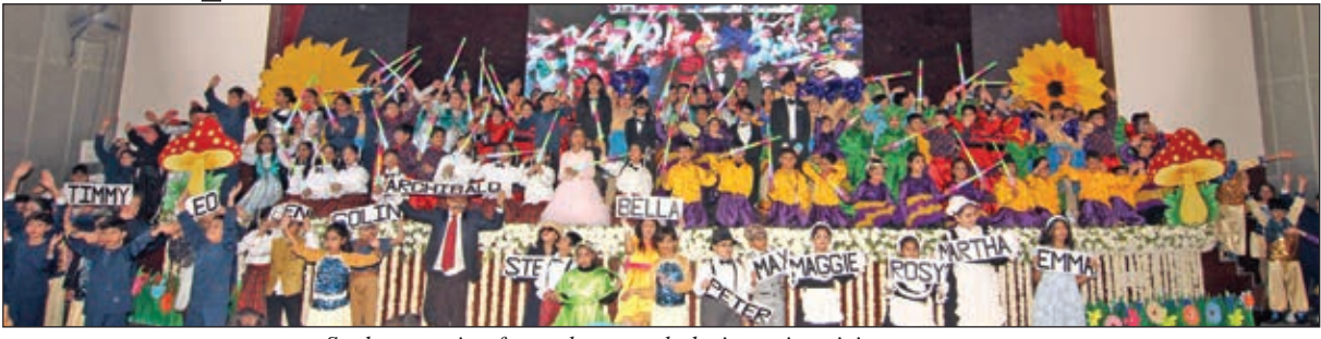
Students posing for a photograph during prize-giving ceremony.