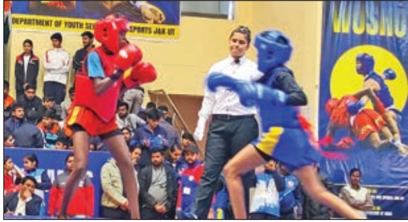
Players in action at Wushu match in Jammu on Saturday.

STATE TIMES NEWS JAMMU: Athleticism, motorability and anticipation was on display as eleven players from J&K including ten boys and a lone girl entered the medal bouts stage in the ongoing 68th National School Games in the discipline of Wushu, being organised by the Directorate of Youth Services and Sports J&K, under the auspices of School Games Federation of India (SGFI) at Indoor Sports Complex Bhagwati Nagar here on Saturday. A total of 129 bouts were held today with 115 in the boys category and 14 in the girls category. The players from J&K, who secured berth in the medal bouts stage in boys U-