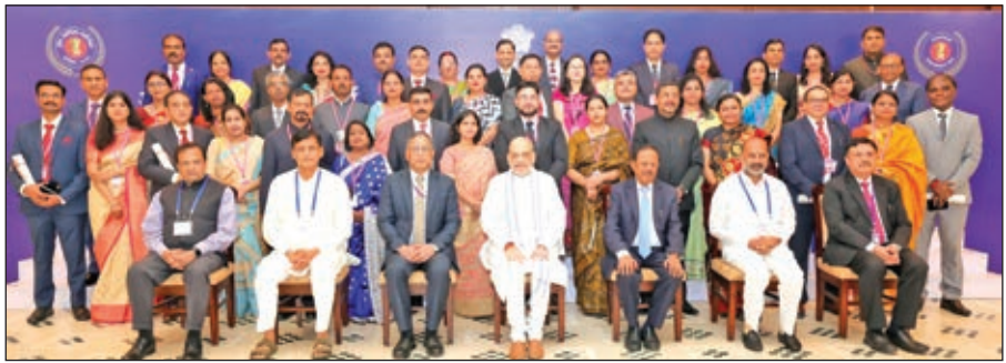
Union Home Minister Amit Shah at the annual DGPs/IGPs conference in Bhubaneswar.

Expresses satisfaction over improvement in security situation in J&K