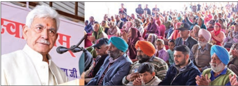
LG Manoj Sinha addressing at the 'Ati Vishnu Mahayagya' at Pouni on Friday.