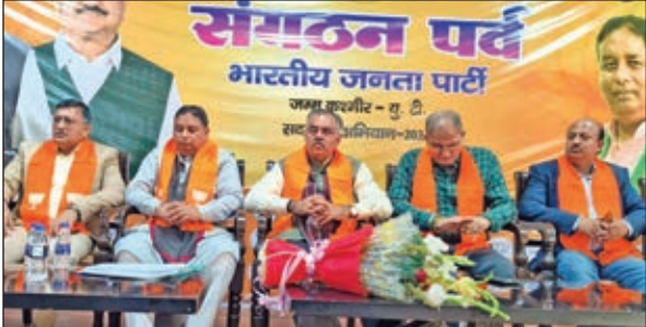
BJP National General Secretary and In-Charge for J&K and Ladakh, Tarun Chugh and others during party meeting.

'Mehbooba's remarks reflect ideological bankruptcy'