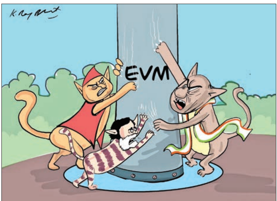
Supreme Court clears EVMs but....