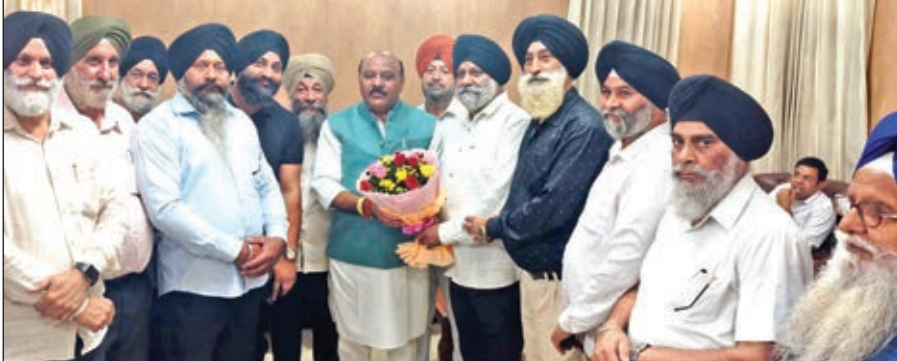
DGPC Jammu delegation calling on Deputy Chief Minister, Surinder Kumar Choudhary.