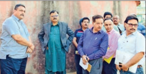
Minister for Jal Shakti, Javed Ahmed Rana during surprise visit to Sitlee Filtration Plant at Nagrota.

■ STATE TIMES NEWS JAMMU: Minister for Jal Shakti, Tribal Affairs, Forest, Ecology & Environment, Javed Ahmed Rana, on Saturday conducted a surprise visit to Sitlee Filtration Plant at Nagrota and inspected functioning of the premier installation for