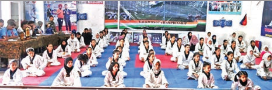
Participating Taekwondo players at 77th Poonch Link-Up Day Taekwondo Championship.

■ STATE TIMES NEWS POONCH: In a spectacular display of martial arts prowess, over 500 students from various schools in Poonch district participated in the 77th Poonch Link-Up Day Taekwondo Championship, organized by the Indian Army. This exciting event was held in celebration of the upcoming 77th Poonch Link-Up Day on November 22, 2024, commemorating Operation Easy, a pivotal operation conducted by the Indian Army in 1948 to protect the Poonch region from invading forces. The championship was divided into multiple categories for boys and girls, aiming to promote sportsmanship, talent, and unity among the youth. Winners from each category were awarded cash prizes, medals, and certificates, recognizing their outstanding achievements. The event showcased the immense potential and enthusiasm of the young participants, who demonstrated