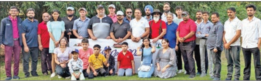
First-year Bachelor of Design students from SMVDU with others at JTGC.

■ STATE TIMES NEWS JAMMU: First-year Bachelor of Design students from Shri Mata Vaishno Devi University (SMVDU) visited the Jammu Tawi Golf Course (JTGC) amidst the ongoing JK Open 2024. The event, organized by the Directorate of Tourism Jammu in collaboration with the Professional Golf Tour of India (PGTI), offered students a unique learning experience