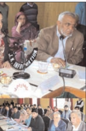
Minister for H&ME, Sakeena Masood chairing a meeting.

schemes and projects in these departments.