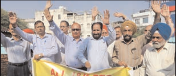
Retired employees of J&K RTC raising slogans during a protest.

■ STATE TIMES NEWS JAMMU: Retired employees of the All J&K RTC gathered near Maharaja Hari Singh Park in Jammu to stage a demonstration and sit-in protest.