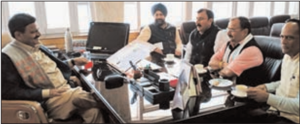
Minister for Jal Shakti interacting with legislators.