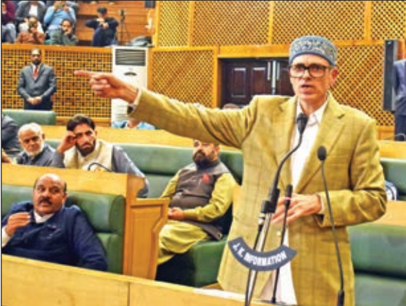
CM Omar Abdullah speaking during last day of session of Jammu and Kashmir Assembly on Friday.

"It's been a long time since I last spoke in this House as