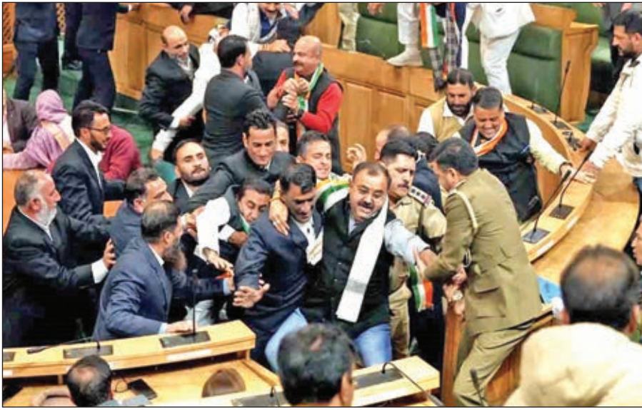
BJP legislators being marshalled out from J&K Assembly at Srinagar on Friday.

■ STATE TIMES NEWS SRINAGAR: Ruckus prevailed in the Jammu and Kashmir Assembly for the third day on Friday as BJP members protested over the