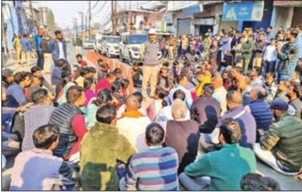
Protesters blocking road at Kishtwar.

Terrorists killed two VDGs after abducting them in the higher reaches of the Kishtwar district. Jaish-e-