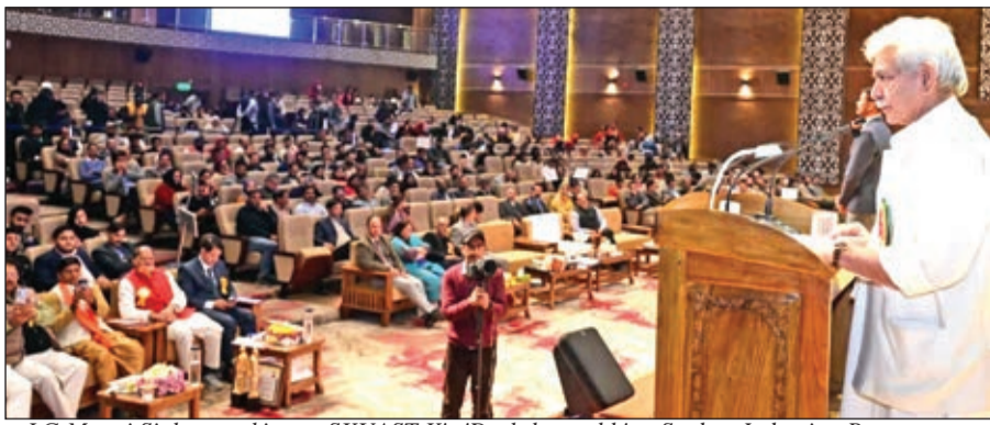
LG Manoj Sinha speaking at SKUAST-K's 'Deeksharambh', a Student Induction Programme.

STATE TIMES NEWS SRINAGAR: "We must sprint ahead in agriculture and allied sectors to fuel India's growth story," the Lieutenant Governor, Manoj Sinha said on Friday. He said to build a developed India, our prime objective should be to achieve a consistent 5% annual growth rate. The Lieutenant Governor highlighted the need for cultivating change in agriculture education to ensure sustainable practices in future. "Educational institutions like SKUAST should focus on AI-powered farming and diversification into high-value crops with strategic planning to boost productivity and income of farmers," the Lieutenant Governor said. He was speaking at the SKUAST-Kashmir's 'Deeksharambh', a Student Induction Programme, titled as "Aneka Mein Ekta