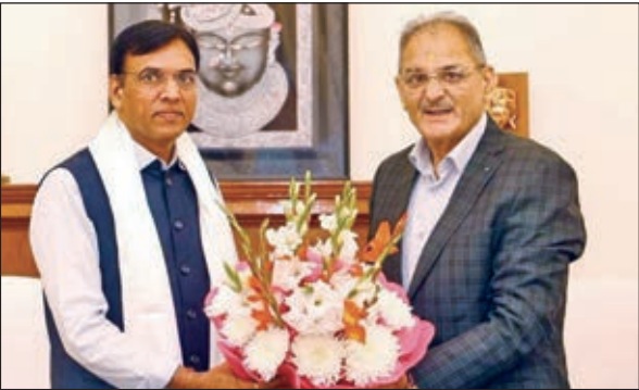
LG Ladakh, Kavinder Gupta calling on Union Sports Minister, Dr. Mansukh Mandaviya in New Delhi.

While submitting a memorandum of demands to the Union Minister, the Lt Governor highlighted Ladakh's growing reputation as a winter sports destination, noting the successful conduct of the Ice Events of the 4th and 5th Editions of the Khelo India Winter Games in 2024