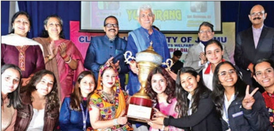
Lieutenant Governor Manoj Sinha at valedictory programme of 'Yuvtarang', a cultural and literary festival being organised by Cluster University of Jammu.

"As catalysts for change, youth with moral courage, energy and conviction should turn the tide of history and prepare a new path for the coming generation," the