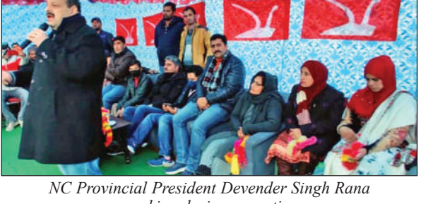
speaking during a meeting.

The Provincial President recalled the developmental strategy adopted during various stints of the National Conference government and said the impact is visible in every nook and corner of the two regions. The projects and utility services speak for themselves and stand testimony to