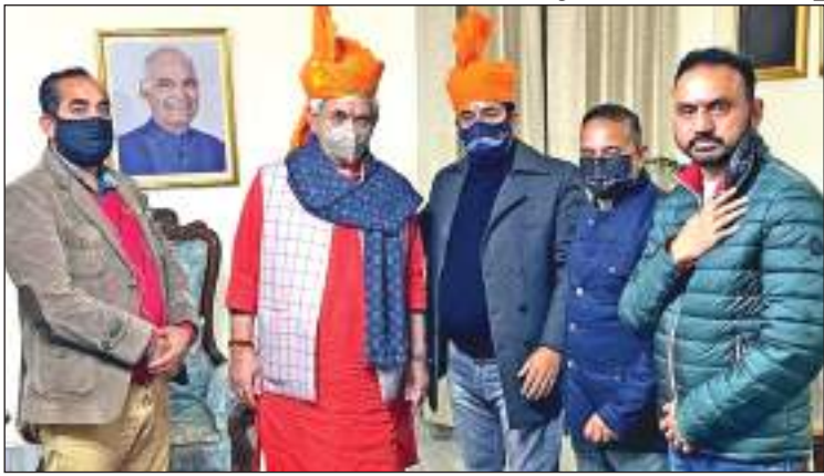
Yuva Rajput Sabha members calling on the Lieutenant Governor, Manoj Sinha.

The representatives of Yuva Rajput Sabha expressed their