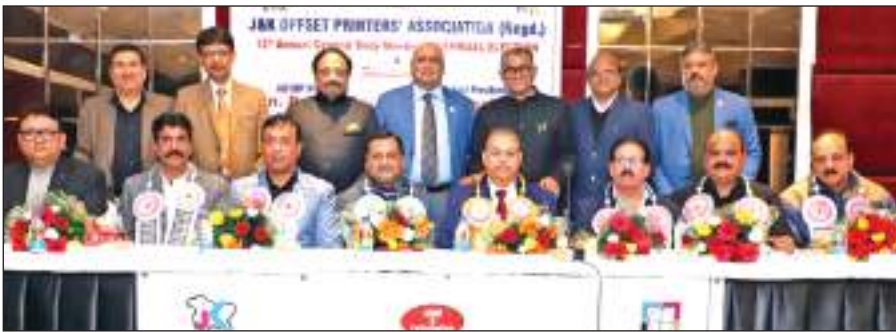
JKOPA members and others during annual general meeting at Jammu on Friday.