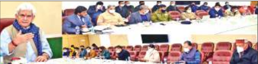
LG Manoj Sinha interacting with Chairpersons and Vice-Chairpersons of District Development Councils of Jammu Division at Civil Secretariat, Jammu.

JAMMU: LG Manoj Sinha on Monday interacted with the Chairpersons and Vice-Chairpersons of District Development Councils of Jammu Division at Civil Secretariat. During the interaction, the Lt Governor took first-hand appraisal of the district-specific developmental needs of the people, and received feedback from the DDCs on implementation of developmental works and progress made under District Capex in their respective constituencies.The Lt Governor reiterated the commitment of J&K Administration for delivering good governance to the villages by strengthening Panchayati Raj Institutions. "It is our firm resolve to remove developmental imbalances. Sustained economic growth, efforts to meet the basic needs of the people and better quality of life constitute priorities of district administration and PRIs", said the Lt Governor. The Lt Governor acknowledged the crucial role being played by the DDCs & other PRIs in ensuring benefits of rapid economic growth flows to