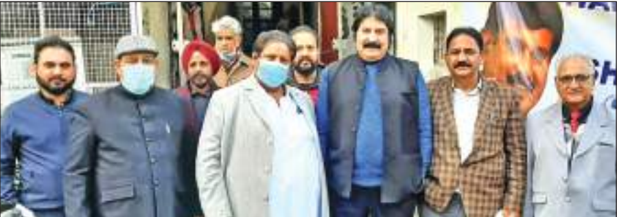
Congress leaders after a meeting in Jammu on Monday.

JAMMU: Jammu and Kashmir Pradesh Congress Committee has fully supported the demand of holiday on the birthday of the last ruler of Jammu and Kashmir Maharaja Hari Singh and asked the LG administration to declare holiday in this regard without further delay. In a joint statement senior functionaries of JKPCC have fully endorsed the demand and extended full support to the struggle of Yuva Rajput Sabha and others, for declaring holiday on the birth day of Maharaja Hari Singh. The Congress party has already endorsed the demand several times, since it was strongly raised and always extended its support in this regard.