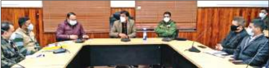
Deputy Commissioner Anshul Garg chairing a meeting at Jammu on Monday.

The Deputy Commissioner also sought the cooperation