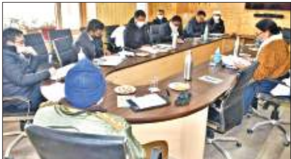
Rinchen Lhamo, NCM Member, Govt. of India interacting with a delegation.

They also stressed the need for creation of various posts