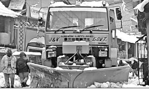
Snow clearance work in progress at Bhadarwah.

■ STATE TIMES NEWS BHADARWAH: Considering the miseries of the people residing in far off areas in absence of road connectivity which got snapped after heavy snowfall, Administration expedite the restoration process in Additional District Bhadarwah. Tehsildar Bhadarwah