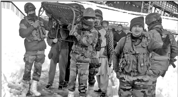
Army Jawans carrying a woman in snow-bound area.

■ STATE TIMES NEWS BHADARWAH/BANIHAL: In a great good will gesture, Army's RR unit based at Banihal rescued a lady patient in snow bound area near Railway Station on Monday. According to reports, Army evacuated an elderly woman patient stucked in snowfall near Railway Station and after first aid, dropped her to their residence at Magerkote area of Banihal amid snowfall and extreme cold weather conditions. Army spokesperson said that Banihal unit of Army received a distress phone call