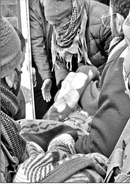
Army officials evacuating ailing woman to hospital.