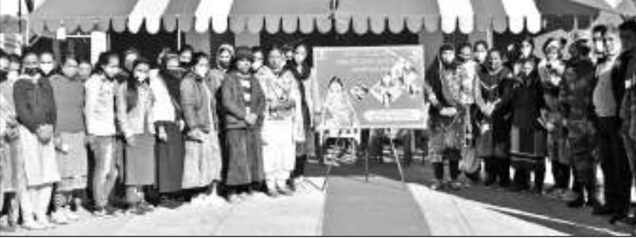
Army officials along with participant women.

■ STATE TIMES NEWS NOWSHERA: As a part of skill development and to take initiatives for women empowerment, a