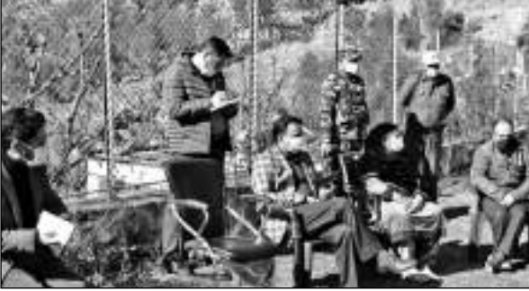
Officials listening to people's grievances.