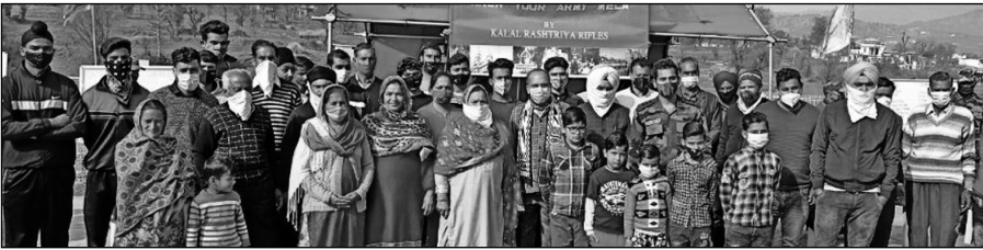
Army officials posing for a photograph with people during a programme.

Currently, there are no particular regulations or any ban on use of cryptocurrencies in the country.