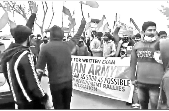
Youth staging protest at Sunderbani.

Speaking on the occasion, BDC Chairman said Jammu